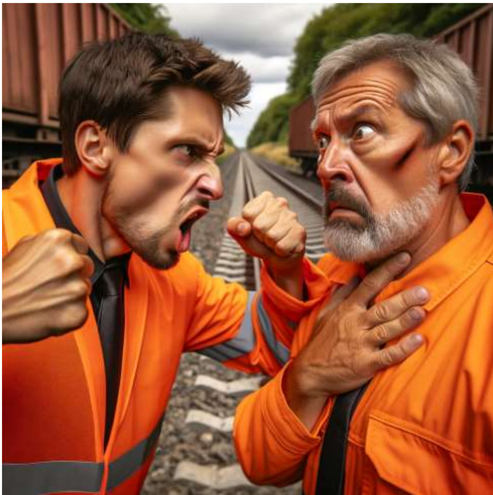
Everyone at some time can be vulnerable to a bully