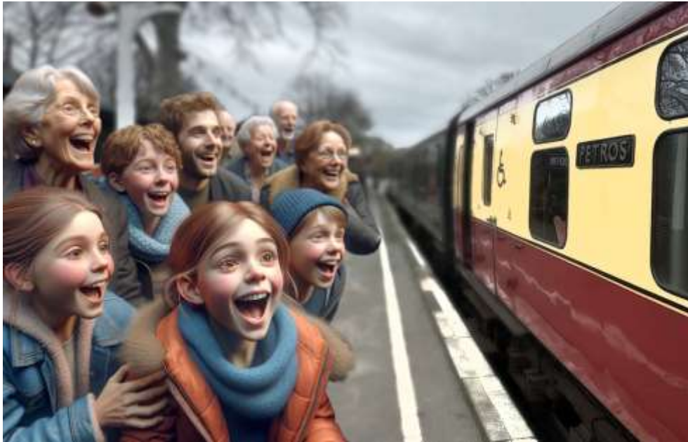
Visitors should feel safe.