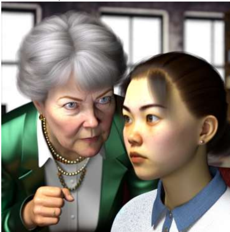
Regardless of who it is.