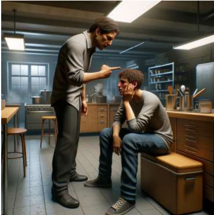
Bullying an apprentice or young volunteer is never acceptable.